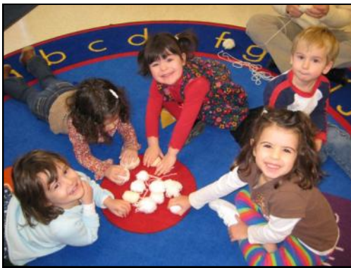
ECEC Play Time

Our pre-school program is called The Early Childhood Engagement Center (ECEC) . We provide a hands-on experience in a Jewish environment of individualized learning and growth. Inspired by the Reggio Emilia approach to early childhood education, children are engaged to acquire skills of critical thinking and collaboration. We explore Jewish culture and heritage through nature, songs, artwork and stories designed for two-five years olds. Each week culminates in a delightful Shabbat service with our Rabbis.