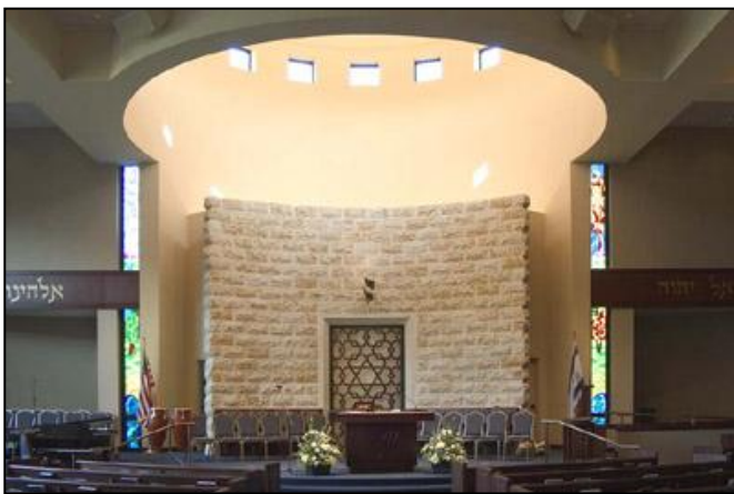
Jefferson Road Campus 1129 Jefferson Road, Greensboro NC 27410 (336) 292-7899