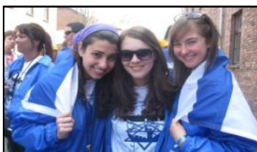
March of the Living Trip

Our Rabbis are committed to giving teens the awareness that their actions will impact the future of the Jewish people. We are proud to report that the religious school retained 80% of the recent 12 th grade class after B'nai Mitzvah. In the past few years, we have maintained between 70-80% of all of the kids who have become a B'nai Mitzvah. Three quarters of those we have retained go to Israel before high school graduation. In 2010, 100% of our teens had been to Israel.