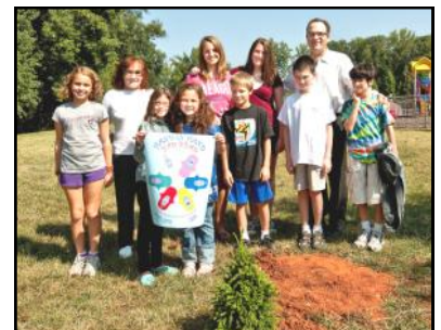
First Day of Religious School