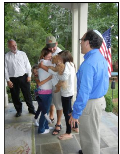
Family Hug - Mezuzah Caravan