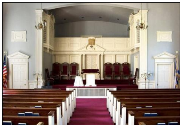
Greene Street Campus 713 N. Greene Street, Greensboro NC 27401

*First Friday Evening of every month Shabbat Services 6:30pm