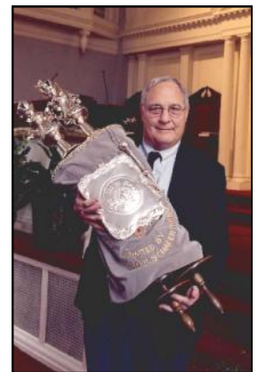
Adult Bar Mitzvah

The community is also invited to join us every Saturday morning at 9:00a.m. for our master class, Chevra Torah , in the Boardroom at the Jefferson Campus. This lively study group, led by one of our rabbis, explores the weekly Torah portion. No prerequisite knowledge is needed and all, regardless of background, are welcome.