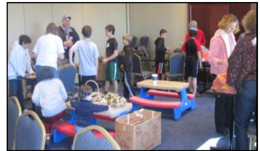
Preparing Meals and Kits for Streetwatch

The Social Action Committee addresses issues that have a social, political, environmental or religious impact on us as Jews and citizens of the community. In keeping with URJ resolutions and guidelines, the committee works to provide opportunities for Temple members of all ages and abilities to work toward making a positive difference locally and fulfilling our mission of Tikkun Olam , repairing and healing the world.