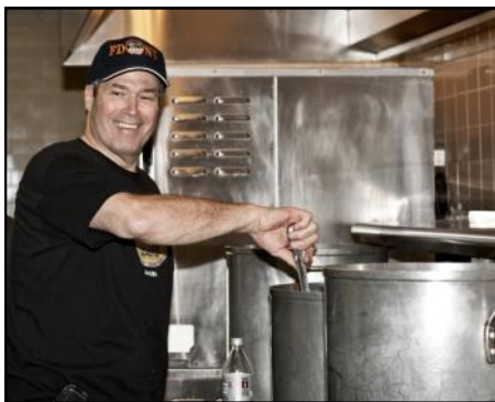
Urban Ministry, meal preparation

The annual membership fee is $40.00 and the first year is free for new members. We encourage your participation and look forward to your involvement in our upcoming events.