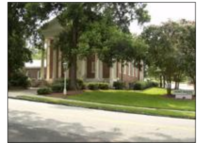
Greene Street Campus