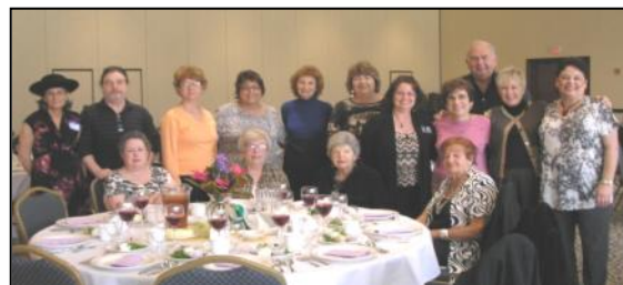
Friendship Circle Seder

The group meets the 1st & 3rd Thursday of each month at 12:00pm for fun, food, fellowship and special programs. Outside activities for this group consist of weekend bus tours and day trips, attending evening functions, personal visitations, luncheons out, and hosting senior groups from other congregations for lunch.