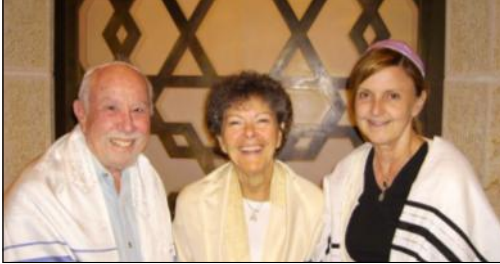
Adult B'nai Mitzvah