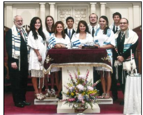
Confirmation Class 2011