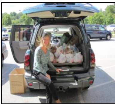
Out of the Garden Project