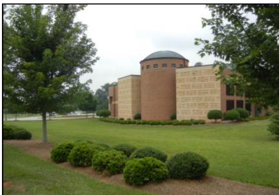
Jefferson Road Campus

School wing and it was established later that year.